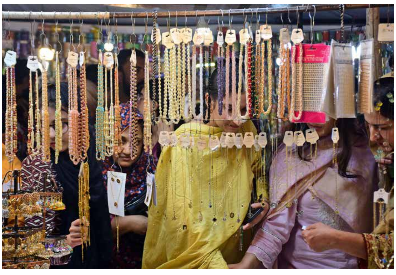
ISLAMABAD: Women busy in selecting artificial jewelry for preparation of upcoming Eid ul Fitr, in the Federal Capital.