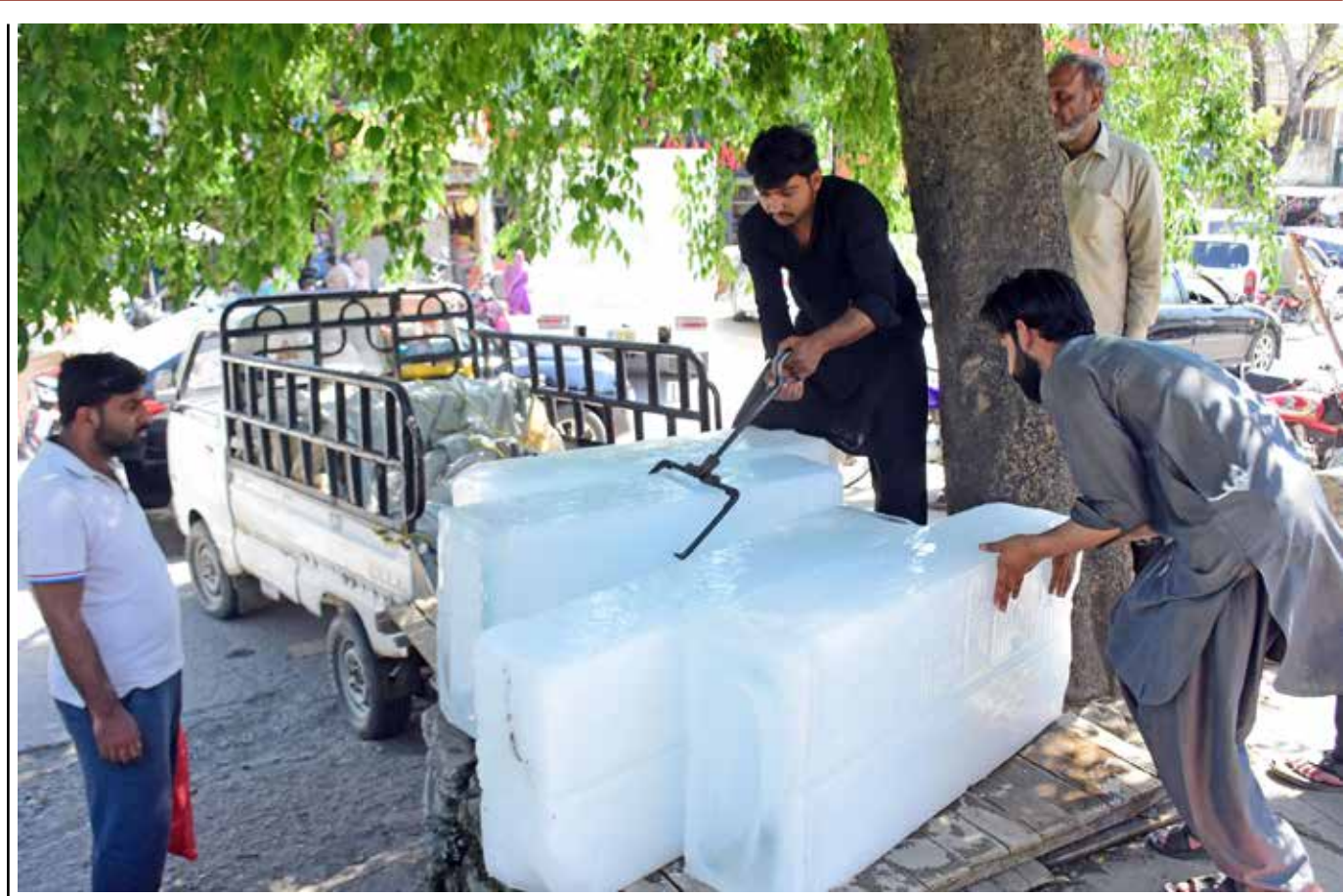
ISLAMABAD: A vendor is displaying Ice blocks for selling purpose at his roadside setup at Aabpara Market, in the Federal Capital.

According to experts, in the eight months of the current financial year, the internal debt of the government has increased by 10 per cent to Rs42,671 billion and the external increasing and in debt has increased