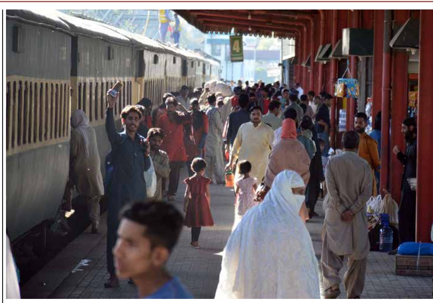
RAWALPINDI: People board a train at Pindi Railway station to celebrate the joyous occasion of Eid-ul-Fitr with their loved ones. — Staff Photo

vide a variety of shopping opportunities for shoppers but also a great income generation opportunity for the stallholders. Any type of accessories relating to women and garments for children are the most profitable business, he added. The last weeks of Ramadan also witnessed a huge rush at beauty salons and ready to wear boutique dresses. "I bought a pink dress and now looking for matching shoes and then I have to buy matching jewellery, hair clips, and bangles. I will again come with my family on 'chaand raat' for henna," Aiza Khan, who is five years old, said. "I have visited the market to buy bangles and observed that bangle stalls are very few and the prices are