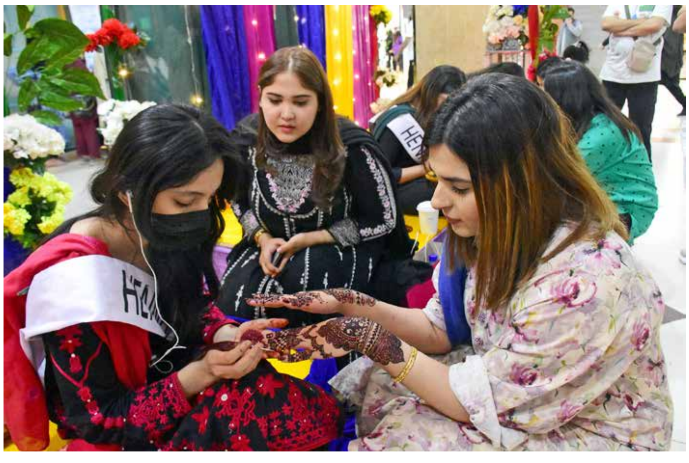
ISLAMABAD: Beautician applies traditional henna designs to the hand of a customer ahead of the Muslim festivities of Eid al-Fitr, in the Federal Capital.